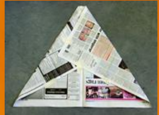
Fold a sheet of paper for the cladding