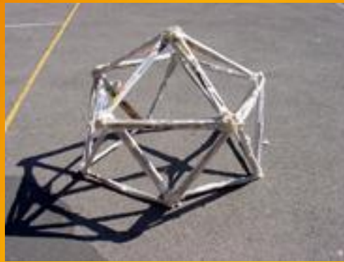
A geodesic structure