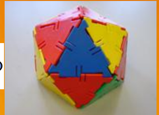
15 triangular units made this model