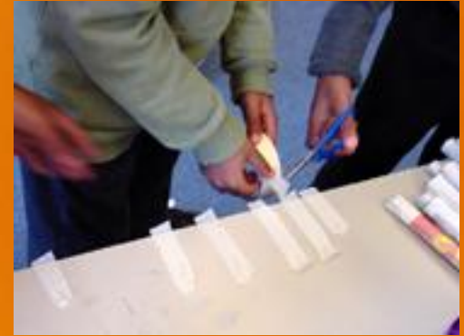
Cut or tear strips of masking tape